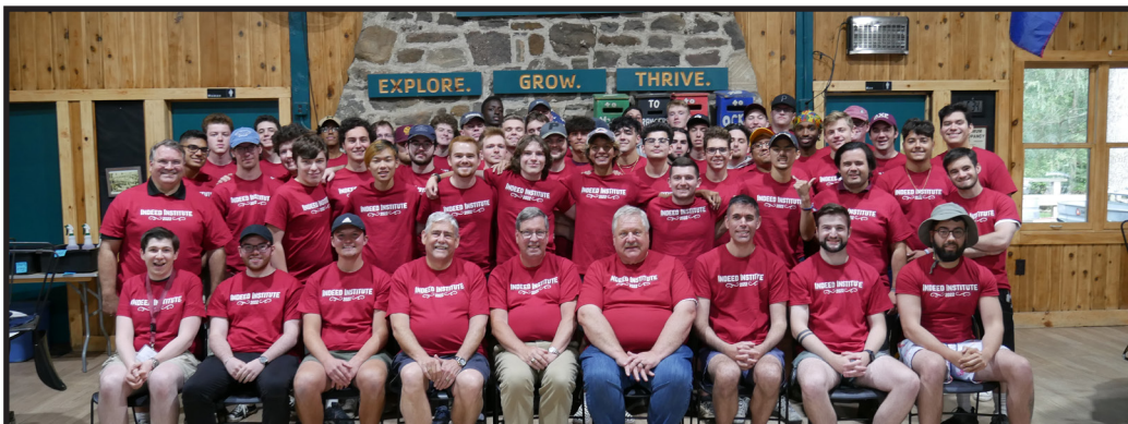
BROTHERS ATTENDING THE INDEED INSTITUTE IN 2022

Within a one-hundred mile radius of Lehigh University, there are ten Chapters of Alpha Chi Rho. Those Chapters are located at Gettysburg College, Penn. State University, Kutztown University, Montclair State University, Seton Hall University, The College of New Jersey, Rowan University, Rutgers University - Camden, Drexel University, and the University of Pennsylvania. If we were to expand to Lehigh again, there is no doubt that the Alpha Chi Rho men on campus would have support, guidance, and genuine camaraderie from these neighboring institutions.