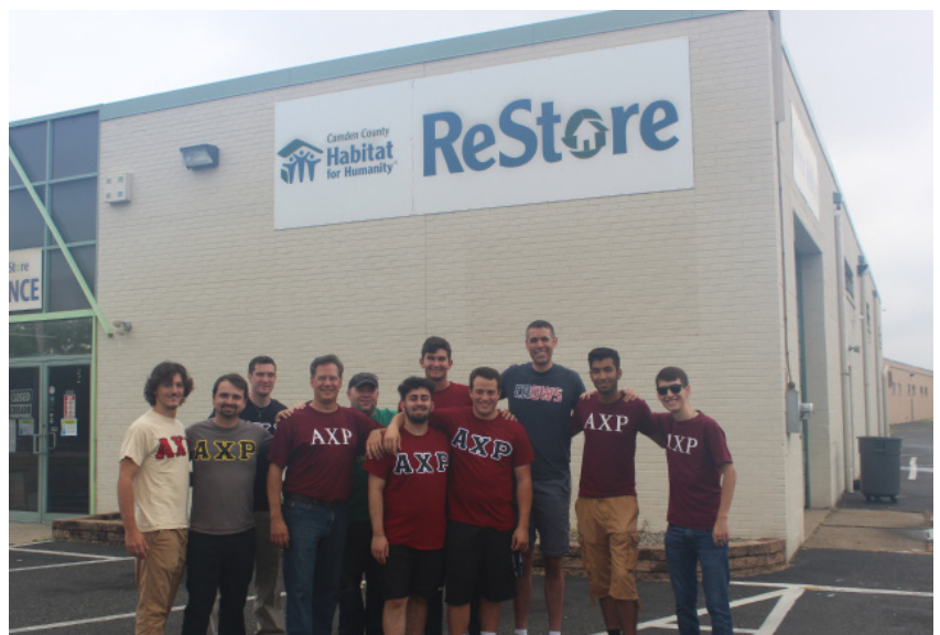
BROTHERS VOLUNTEERING AT HABITAT FOR HUMANITY AT THE 105TH NATIONAL CONVENTION IN 2019