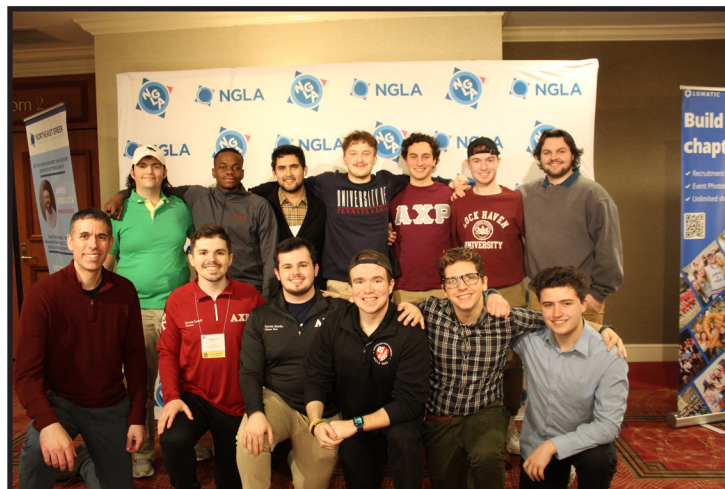
BROTHERS ATTENDING NGLA 2023