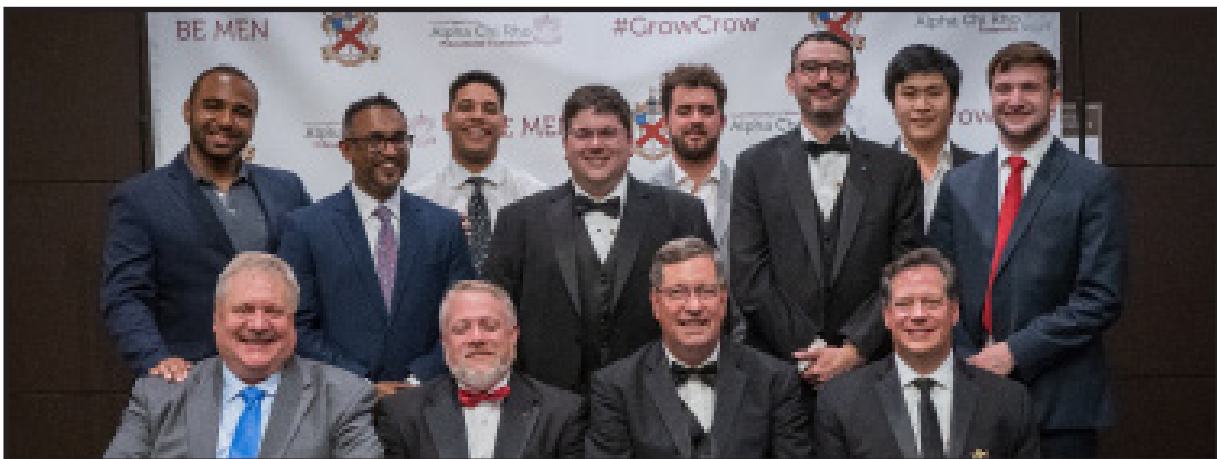
THE NATIONAL COUNCIL AT THE 105TH NATIONAL CONVENTION IN CHERRY HILL, NJ 2019

In addition to the mandatory events identified above, Chapters organize a football tournament known as Crow Bowl. This inter-Chapter event is an excellent way for Brothers to network and socialize among each other.